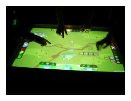
Fig. 1. Sustainability game on our custom tabletop

There are three distinct roles that players can take: food, shelter, or energy supply. Each role has an individual toolbar oriented to each of the three sides of the table (Figure 2). The goal of the game is to support the population living in the area without having a catastrophically negative effect on the environment. Players must decide what kinds of food, shelter, or energy producing facilities to construct, and attempts to achieve balance in terms of the population support: neither wasting resources nor failing to provide for the population's needs.